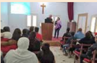
Church in Sweida

In October a Medical team of 10 visited the True Vine Church in the town of Zahlé. As a result of the Corona-Pandemic we were on two different sites. This year's visit began with Corona tests for our team together with the teachers and church workers, ca. 35 people in all. Until we arrived, the private school connected to the church had been closed. Immediately after the tests, which were nearly all negative, lessons could begin again. Both teachers and pupils were happy. The tests would have been too expensive for the school due to the economic crisis in the Lebanon. At the moment the situation there is terrible. Our team of doctors treated around 800 Patients . Several of these required further treatment or operations . We took over all the costs the UN was unable to cover.