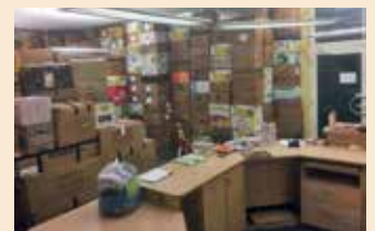
Boxes of warm clothes For Refugees