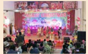
Christmas Celebrations in The School of Grace