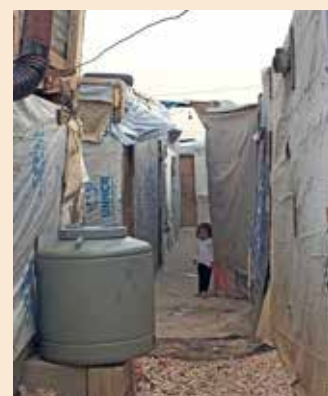
Camp in Lebanon