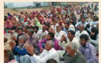
Service in Emmanuel Church