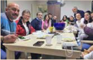
Meeting of the new converts