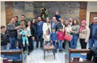
12. birthday of the Alkalima Church