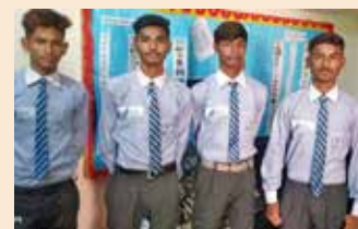
New School Uniforms, Pakistan