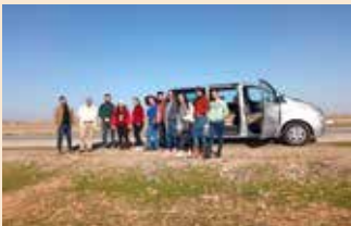
New church van