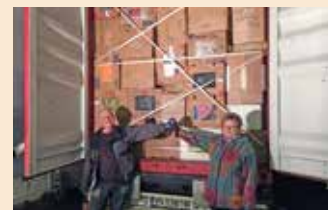
Container with clothes destined for Libanon