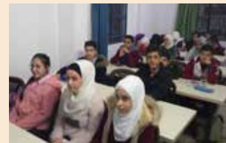
Alkalima Center, Syrien